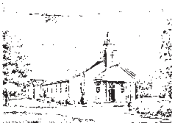
Immaculate Conception 20916 Dalton Road, Box 128, Sutton West, ON L0E 1R0 Rectory: 905-722-3392 parish@immaculateconception.on.ca